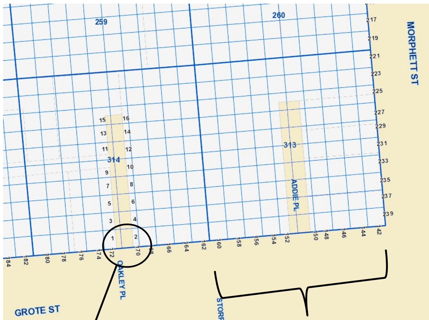
Figure 1. Town Acre Boundary, and street number spacing.

As numbering commences from a Town Acre, both the numbers 70 and 72 Grote Street show the width of their respective numbered frontages to be much smaller than their adjacent numbers.